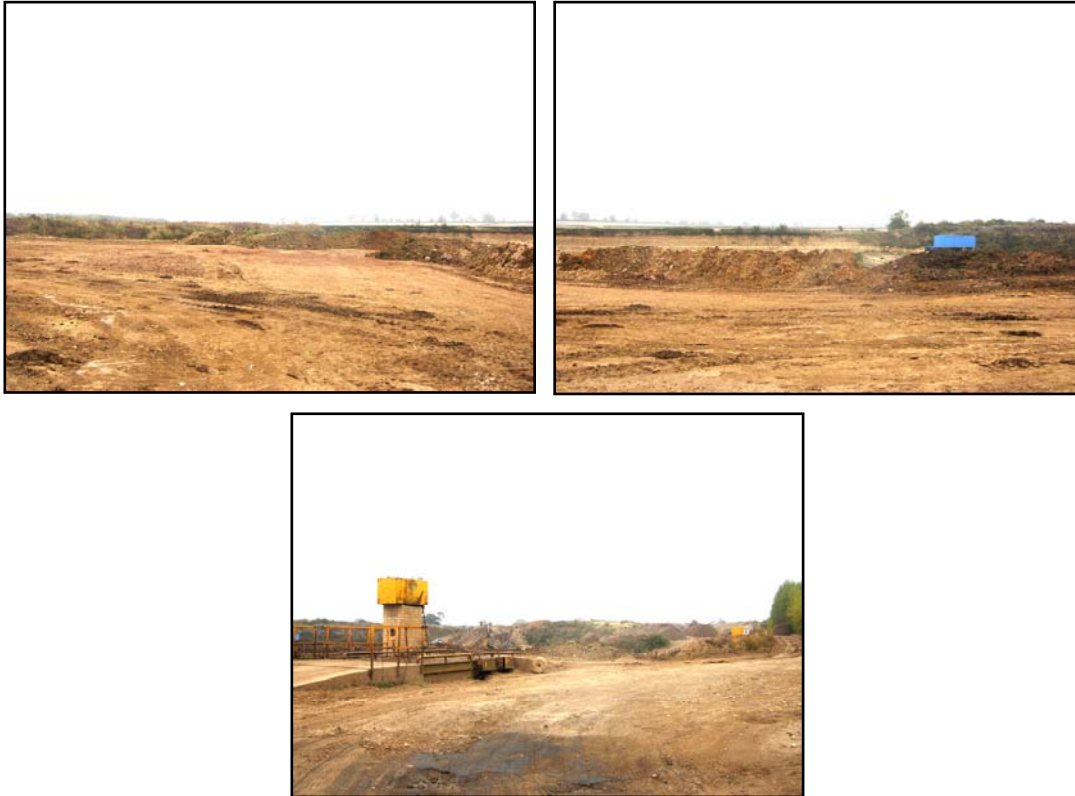
Photos: Views of Harmston Quarry